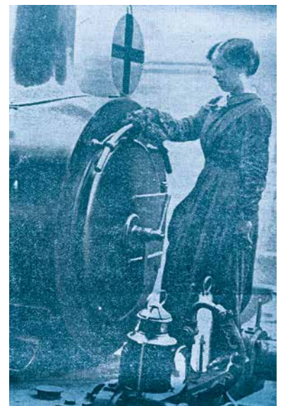
Image: Newspaper clipping showing a female railway worker c.1915.

9 How have they made an impact on your life and what would you say to them if given the chance?